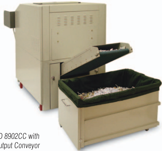
FD 8902CC with Output Conveyor