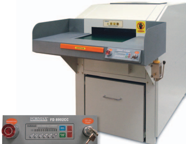
LED Control Panel with Load Indicator