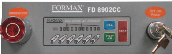
LED control panel with visual load indicator and safety key lock

The FD 8902CC offers unmatched automated features through its LED control panel. The easy-to-read Load Indicator assists operators in determining how close they are to the maximum shred capacity to avoid jams and provide optimal efficiency. Operators can select from two modes of operation: Auto Start/Stop or Manual. Auto Start/Stop mode utilizes optical sensors which detect paper and start/stop operation automatically. Manual mode provides non-stop operation for shredding small sized paper or films. The Safety Key Lock prevents unauthorized use of the shredder.