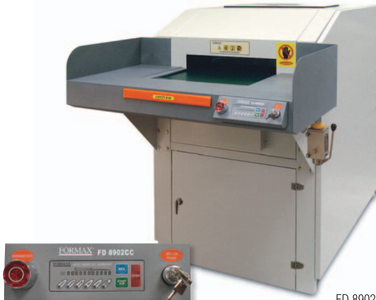
LED Control Panel with Load Indicator