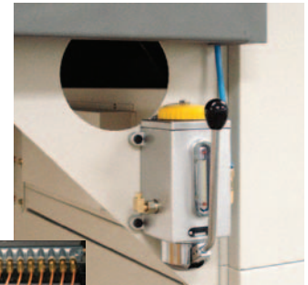
EvenFlow™ reservoir and pump

The FD 8902B features the EvenFlow™ Automatic Oiling System to keep the shredder in peak operating condition. The easy-to-use pump combines with 25 copper distribution nozzles to lubricate the steel cutting blades.