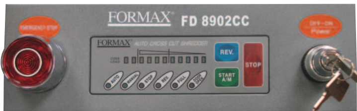
LED control panel with visual load indicator and safety key lock

The FD 8902B offers unmatched automated features through its LED control panel. The easy-to-read Load Indicator assists operators in determining how close they are to the maximum shred capacity to avoid jams and provide optimal efficiency. Operators can select from two modes of operation: Auto Start/Stop or Manual. Auto Start/Stop mode utilizes optical sensors which detect paper and start/stop operation automatically. Manual mode provides non-stop operation for shredding small sized paper or films. The Safety Key Lock prevents unauthorized use of the shredder.