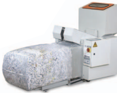
FD 8902B with full bale

The FD 8902B features a powerful high-capacity Output Baler which continually compacts shredded material into a bale, which improves throughput capacity by minimizing the frequency of unloading the shredder. Sensors automatically stop the shredding mechanism when the baler is full. The FD 8902B is the ultimate solution for high-capacity centralized shredding.