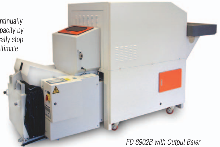
FD 8902B with Output Baler