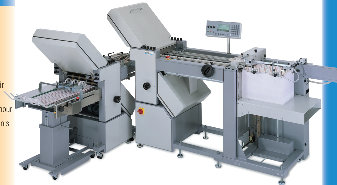
FD 3950-PF in line with FD 3950-R

The 3950 Series Production Floor-model Folders are the ultimate solution for high-volume print shops, fulfillment centers or mailrooms that demand true "production" capabilities. Each model is a fully automated system that significantly reduces set-up time and increases productivity.