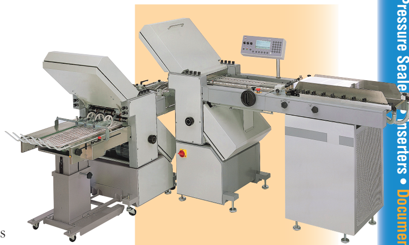
FD 3950 in line with FD 3950-R

* Three-phase power is required, as well as a customer-supplied fork lift for installation.